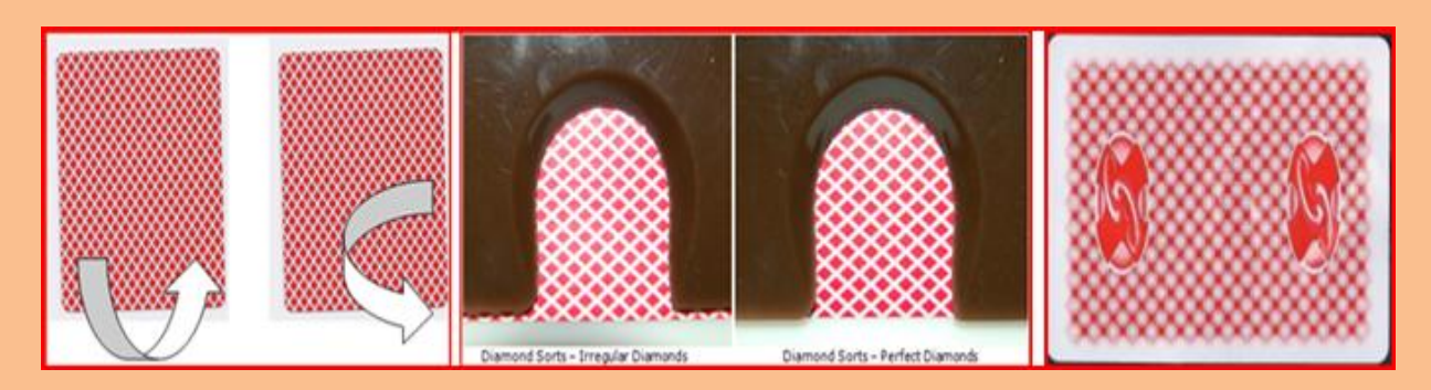
Hidden Camera Player Cut Scam (Actual game video) LV Strip $1,000,000 - Tens of Millions at Casinos Worldwide

Diamond Sort Scheme - LV Strip Casino $1,000,000 - Foxwoods $1,200,000 - London Casino $12,000,000